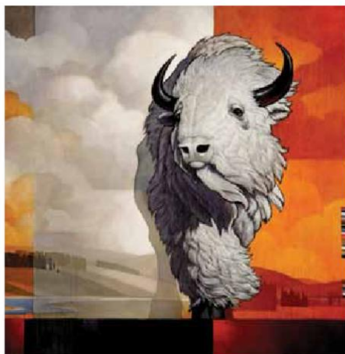
Craig Kosak, White Bison of the East , oil on canvas, 36 x 36"

David Rothermel, Midnight Dance , acrylic on panel, 32 x 27"